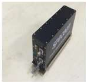
Star-TTT™ , certification in progress (China & Transport Canada) for helicopters and Mid-size aircraft TTT = Track Talk Text