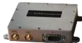
Star- V-trk™ , tracker available 2017 for small platforms in 4 incremental versions :