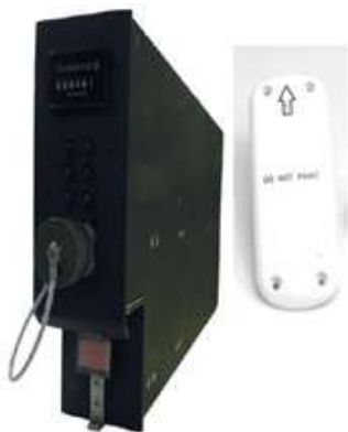
STAR-A.D.S.® fielded to commercial Airlines and business aircraft operators