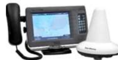
Star-TTT- Maritime™ :